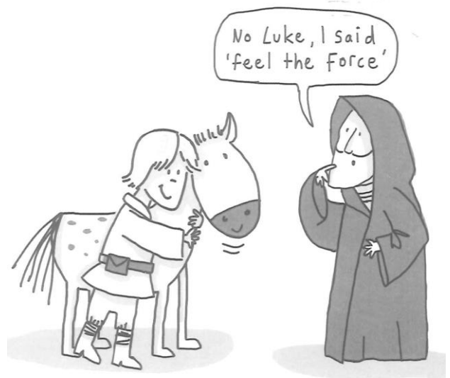
Early Jedi training